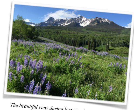
The beautiful view during last year's annual meeting

This meeting is an opportunity for all landowners to participate, contribute and comment on SJV interests. If you have a suggestion for topics, please contact us @ board@SJVLOA.com . Bring a chair and join in! Please, no dogs.